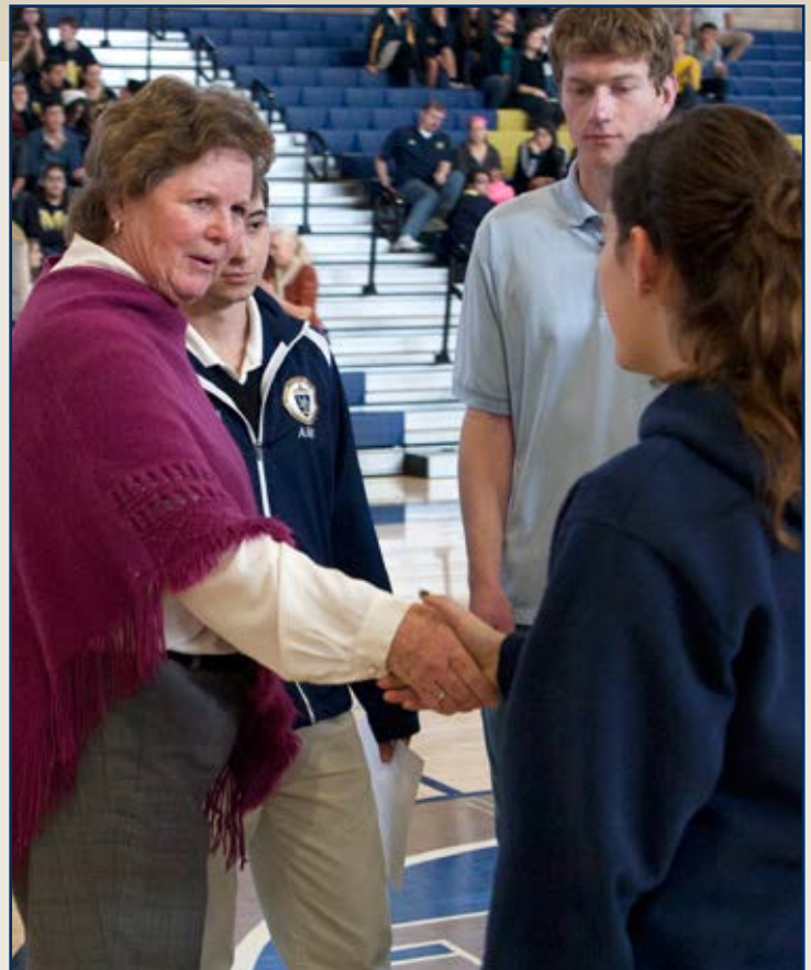
Mayor Cheryl Cox congratulates the MDCHS Solar Power Rangers - p. 3