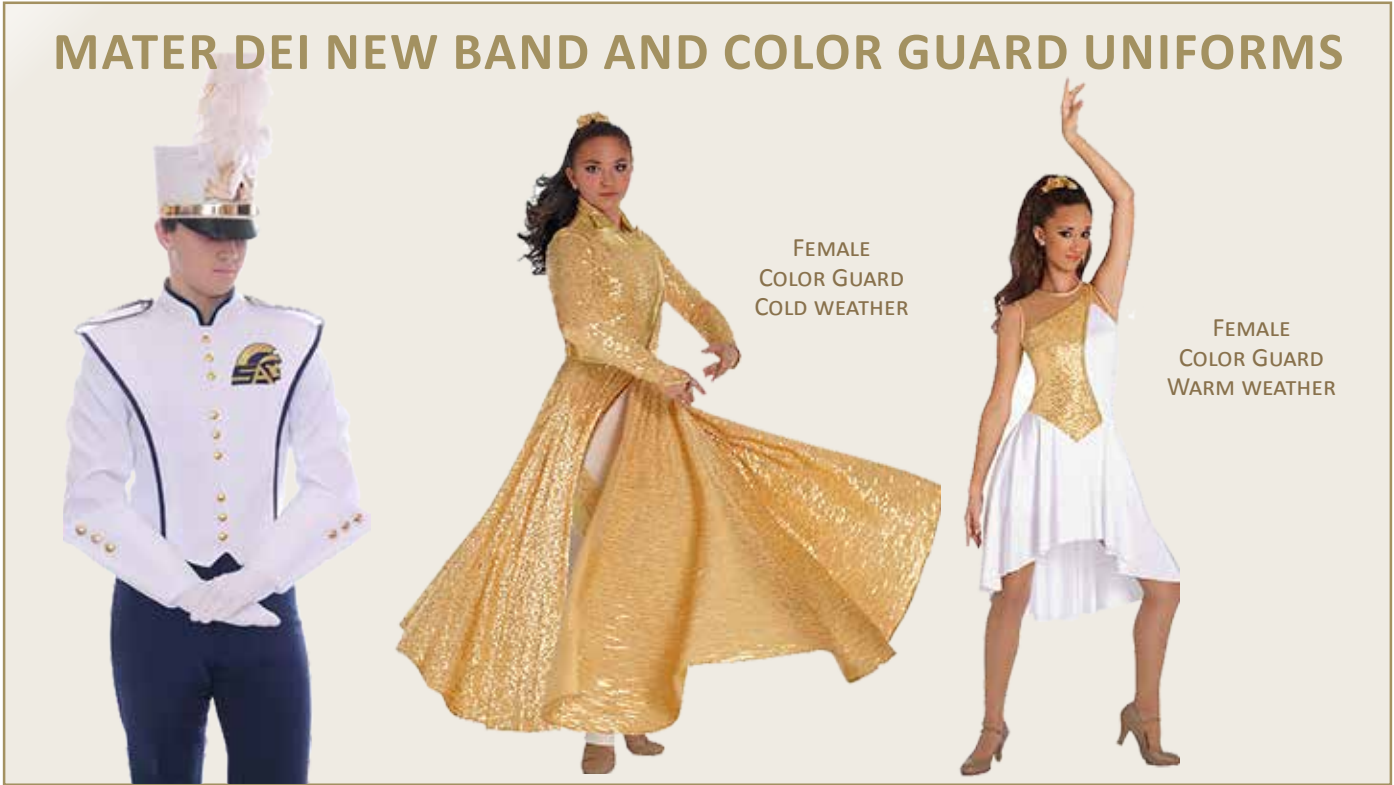
FEMALE COLOR GUARD COLD WEATHER